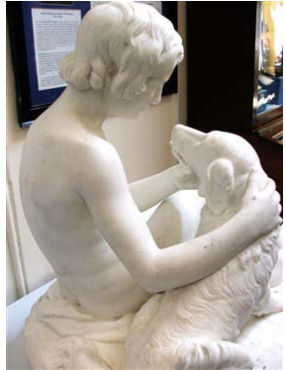
Boy and Dog by Franck, c. 1850

A surprising collection of items from Ancient Egypt, many items donated by the local Peckover family, are brought together here and display the religious, funereal, market and tourist-trade themes which reflect the character of the collection. Amongst the notable items are a mummified hand, a mummified cat and an Ushabti figure reputed to have been removed from the tomb of Seti I by Belzoni. Displays of archaeological finds from the region, including an important group of Bronze Age metalwork, offer a remarkable insight into earlier life in the Fens and what the landscape has yielded. The Roman period in Fenland is examined with displays of Roman pottery including the notable 'Hunt Cup', a colour-coated ware beaker with a 'barbotine' decoration of a hound chasing a hare. Anglo-Saxon artefacts are found alongside a fine Viking sword and battle-axe. Medieval artefacts, which were excavated locally at Emneth, feature amongst the display. The twentieth century is represented with the fixtures and fittings of Mrs Pooley's shop in Elm, which at one time also housed the village Post Office. The array of products provide a colourful and nostalgic insight into the important role the village shop played within the local community and a sign of the changes in our way of life.