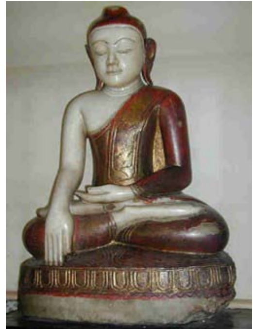
Burmese Buddha late 18th century early 19th century

The geology and the development of the distinctive Fenland landscape are examined in detail on the Upper Gallery. Selections of fossils from the Jurassic, Cretaceous and Pleistocene periods are shown as well as a comprehensive display relating the story of the evolution of the fish. Important geological exhibits from various local Victorian Collectors, founder members of the original Museum Society, provide a focus on collectors whose geological interests were probably little known outside of Wisbech. Associated with this subject are elegant displays of minerals and seashells, and items in the Townshend Room reveal how these minerals, such as agates and malachite, were used to create functional and collectible objects. There are also some interesting miniature replicas of the 'life size' models erected by Waterhouse Hawkins at Crystal Palace (1852-54), which represent the earliest attempts at reconstructing dinosaurs.