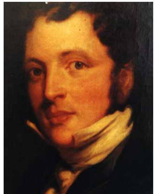
Chauncy Hare Townshend as a young man by J. Boaden , 1825

Among the notable features of this Room are a Sèvres porcelain breakfast service captured from Napoleon's camp equipage after the Battle of Waterloo in 1815; a boxwood chess set, reputed to have belonged to Louis XIV, and a rock-crystal biberon , in the form of a fish, beautifully mounted in silver-gilt, a striking example of Italian decorative art of the sixteenth century. The Room also features interesting items of English earthenware and porcelain as well as examples of Greek and Etruscan vessels, bellarmine of fine quality, with an example or two of Palissy ware and of majolica. A series of 19th century Swiss woodcarvings stand alongside a group of Chinese soapstone figures, and over the fireplace hangs a mirror with an elaborately carved-wood surround in the style of Grinling Gibbons.