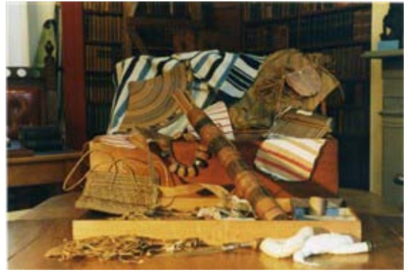
Thomas Clarkson's Chest