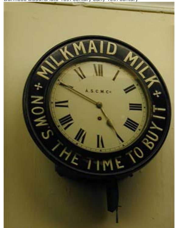
Clock in Mrs Pooley's Shop

Life in the Fens is represented with a range of artefacts which illustrate 'living off the land', 'draining of the Fens', and 'transport and travel', demonstrating the diverse economy of the area. Throughout the Museum there are many objects associated with the history of the town ranging from stonework and woodwork to commercial and domestic items. Other significant objects, which illustrate the eclectic and international nature of the collection, include the marble statue 'Boy and Dog', by the Belgium sculptor Franck, which was shown at the Great Exhibition in 1851 and a very fine example of a late 18th or early 19th century marble Burmese Buddha probably associated with the last royal dynasty of Burma (Konbaung Dynasty 1782-1885).